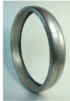
Steel ring housing used on sewer cleaning equipment. 7.00" wide X 42.00" diameter X 0.154" thick steel.